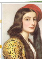
Box 2: Rosa, Maid of Honour

Lambros suddenly felt a tap on his back. Instinctively he clenched his pouch to his chest. Then the familiar voice of his father was heard: "Here you are at last! I was worried crazy. Let's get out of here quickly, things are getting worse. " If the king calls his guards, there will be a bloodshed! " Lambros looked at him decisively. He took off his pouch and gave it to him. "Father, be careful," he said and disappeared into the crowd.