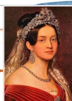
Box 4: Queen Amalia

Colonel Kallergis is waiting patiently. Shortly afterwards, the king's adjutant with the army minister get out of the palace to judge the situation. The colonel orders his men to arrest them.