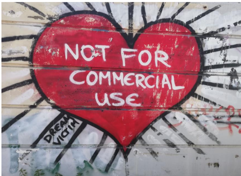
Picture: Photo taken by Pantelis Balaouras, CC-BY-NC-SA. Graffiti by Dream Victim.