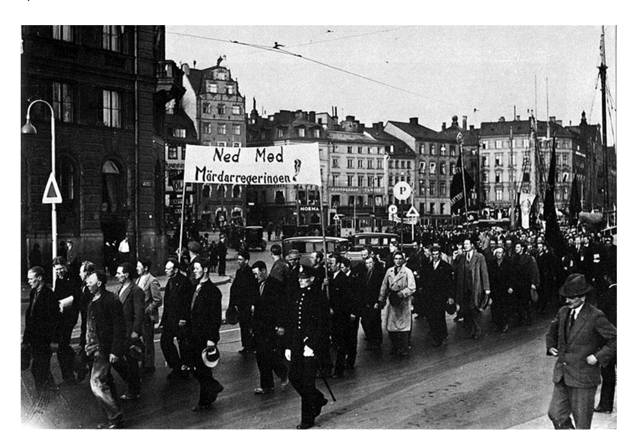
Episode 5: Riot in Adalen

Read the description of the episode and the situation carefully. Do not hesitate to ask your teacher if you are unsure or have further questions of understanding. You can also do further research on the internet if you are particularly interested in a topic.