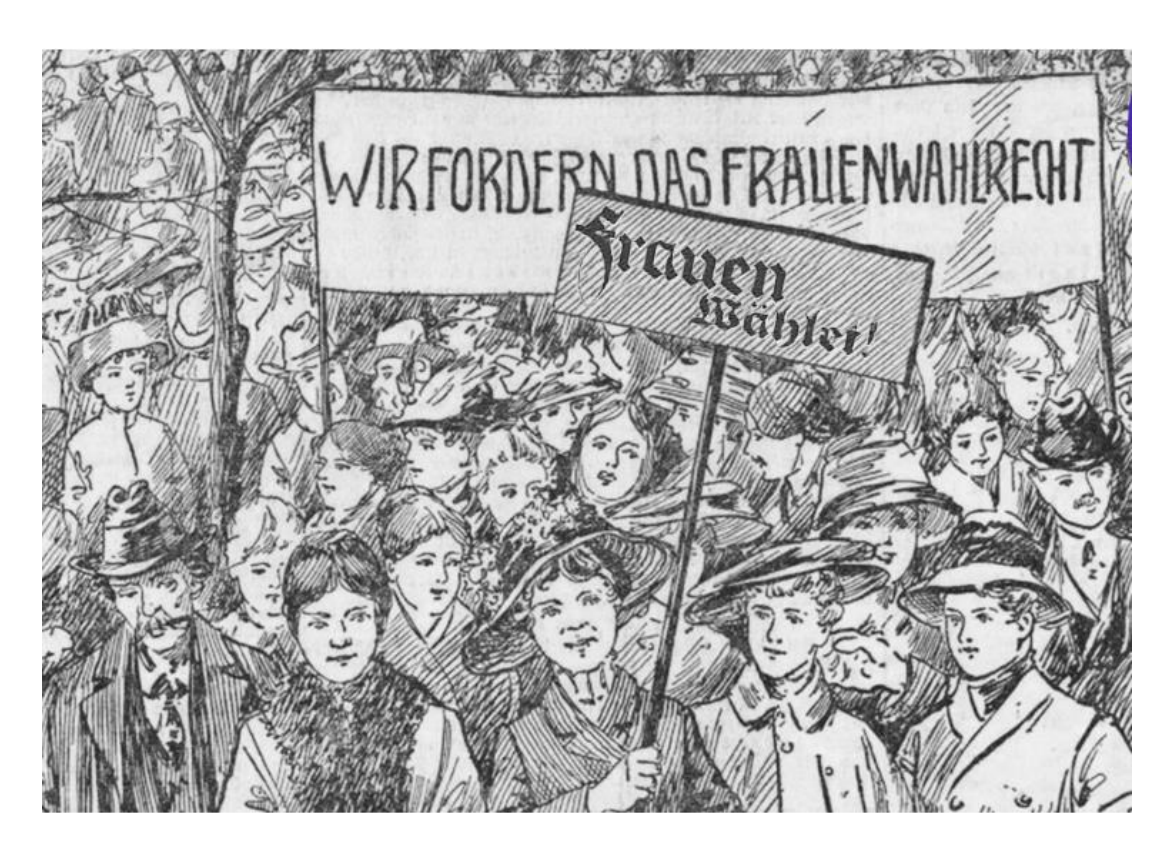
Episode 2: Step out of the shadow!

Read the description of the episode and the situation carefully. Don't hesitate to ask your teacher if you don't know what you're talking about or if you have further questions of understanding. You can also do further research on the Internet if you are particularly interested in a topic.